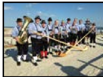
The Philadelphia German Brass Band